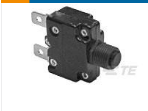
TE Part #1-1423675-0 W57-XB7A4A10-20=CKTBKR,THERM,P