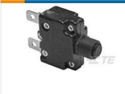
TE Part #9-1423364-6 W57-XB1A7A10-5=CKTBKR,THERM, PB,SCW/QC