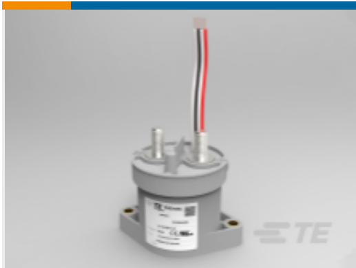
TE Part # 1618416-9 EV210GXANA 1000V 24-48VDC COIL NC AUX