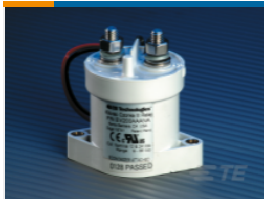
TE Part # 4-1618415-7 EV200HXANA 1000V 24-48VDC COIL NO AUX