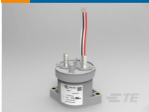
TE Part # 9-1618415-8 EV210GAANA 1000V 9-36VDC COIL NC AUX