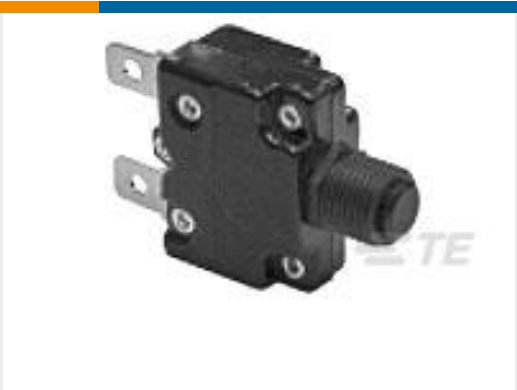
TE Part #5-1423364-5 W57-XB6A99C10-7=CKTBKR,THERM, PB,QC.250