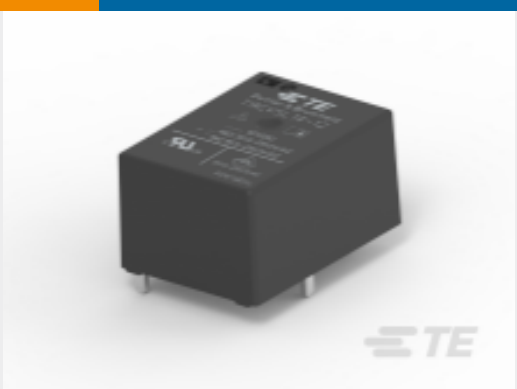
TE Part #1558660-1 T9GV5L14-5