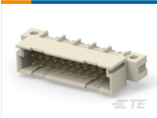
TE Part #384275-E STVB/3 20 M AB VV 4-00 0606 * * 247 E007