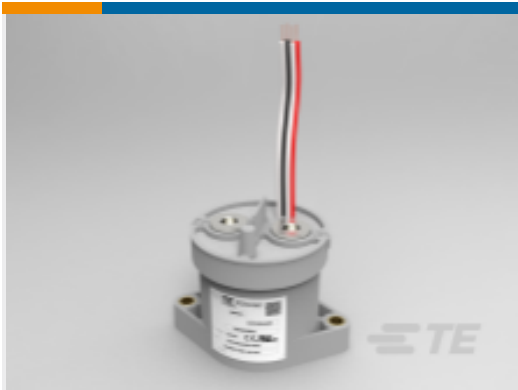
TE Part # 1618416-6 EV210HAANB 1000V 9-36VDC COIL NO AUX