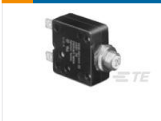
TE Part #1393249-5 W58-XB1A4A-1=W58