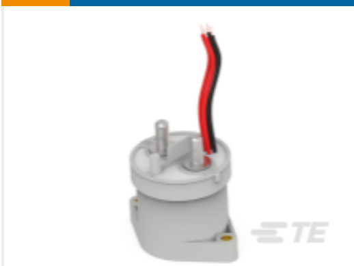
TE Part # 9-1618415-7 EV210HAANA 1000V 9-36VDC COIL NO AUX