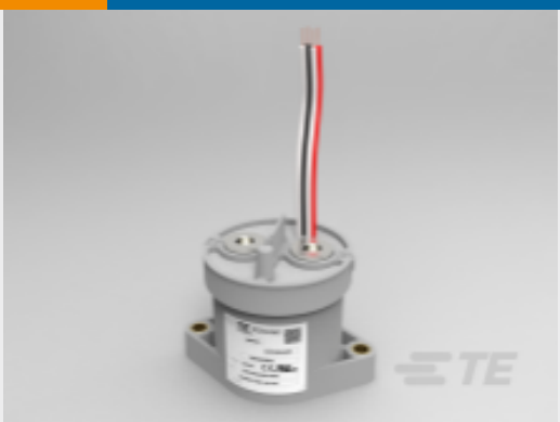
TE Part # 6-1618416-7 EV210HXANB 1000V 24-48VDC COIL NO AUX