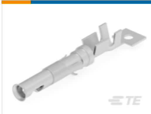
TE Part #827039-2 CIC.SOCKET ASSY.