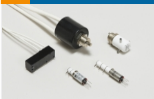
High Voltage Relays(17)