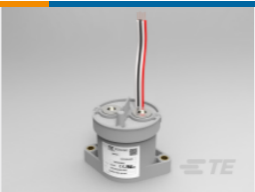
TE Part # 1618416-5 EV210GAANB 1000V 9-36VDC COIL NC AUX