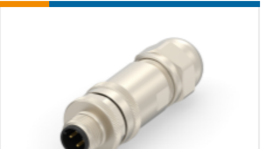
TE Part #T4111511041-000 M12 M, 4P GOLD D_CODE S SHIELDED PG7