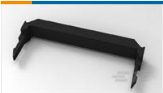
TE Part #499252-2 020 STRAIN RELIEF A-L RCPT