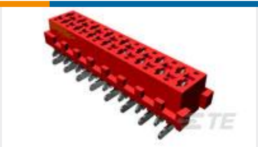
TE Part #8-188275-8 MICRO-MATCH SMD FTE