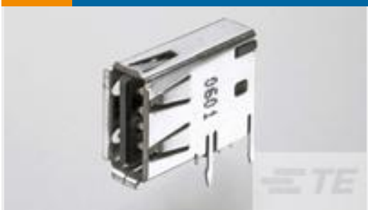
TE Part #292336-1 Std USB Type A, Flag, T/H

PB OFF/ON FC GRE M1 TERM WHI LED IP68 50