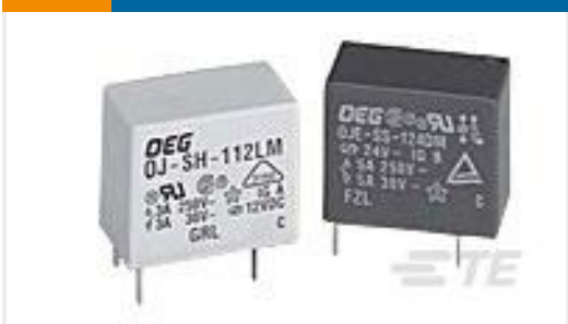
TE Part #1461247-3 OJ-SH-124LMH,000