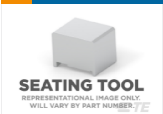
TE Part # 2018530-1 TOOL, SEAT 4 PR 10 COL,BP CONN