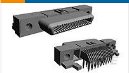
TE Part #5796055-1 68 CHAMP R/A ASSY,LC