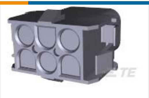
TE Part #1-480705-2 06P UNML CAP HSG RED