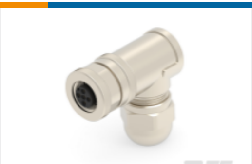
TE Part #T4112012021-000 M12 F, 2P GOLD A_CODE RA SHIELDED PG9