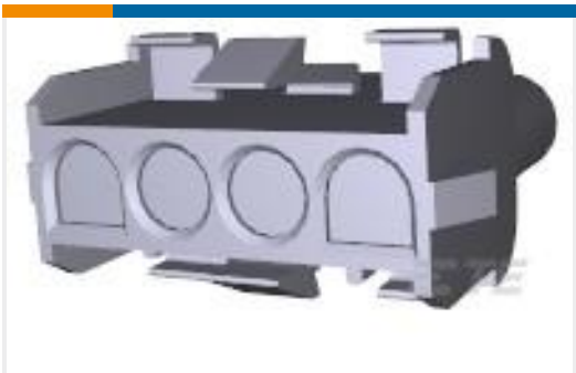
TE Part #1-480703-1 04P UMNL CAP HSG BRN