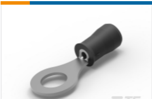
TE Part #36151 PIDG Ring Tongue Terminals