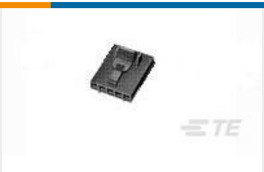
TE Part #1-104257-4 15 MTE RCPT HSG SR LATCH .100