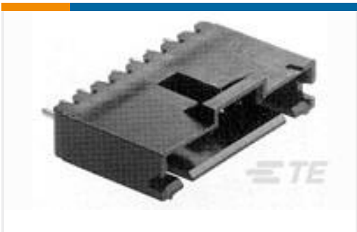
TE Part #5-104363-6 07 MTE HDR SRST LATCH .100CL