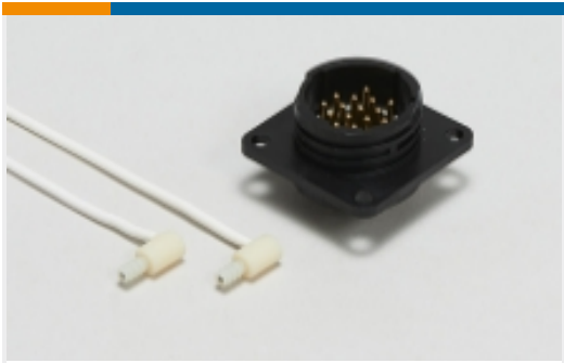
Circular Power Connectors(425)