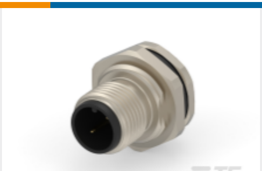
TE Part #T4171010002-001 M12,REAR MOUNTING,MALE,A,2P,0.2 M WIRE