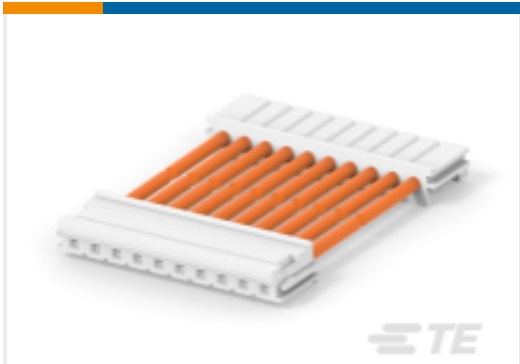
TE Part # 2405419-5 10P TO 10P 300MM CABLE ASS'Y,1-440133-0