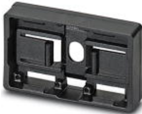
Marker carriers, black, unlabeled, mounting type: Screws, rivets, lettering field size: 27 x 15 mm

Please be informed that the data shown in this PDF Document is generated from our Online Catalog. Please find the complete data in the user's documentation. Our General Terms of Use for Downloads are valid ( http://phoenixcontact.com/download )