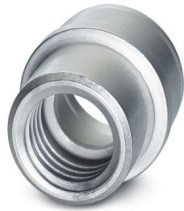
M8 socket, press-in mounting