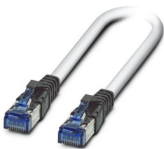
Patch cable, CAT6, preassembled, 12.5 m

https://www.phoenixcontact.com/us/products/2891369