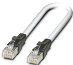
Patch cable, CAT5, assembled, 0.5 m

https://www.phoenixcontact.com/us/products/2832263