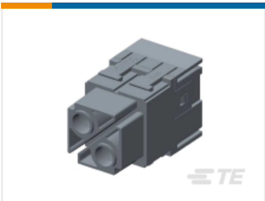
TE Part #T2111028201-000 HMN-D2-FC