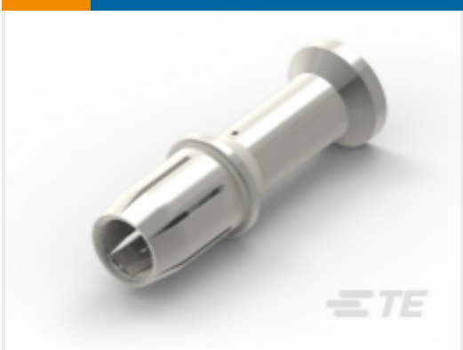
TE Part #T2050002025-000 CNF-25