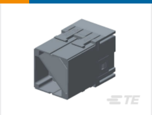
TE Part #T2111028101-000 HMN-D2-MC