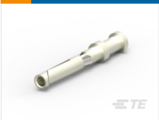
TE Part #T2020002002-000 CDF-0.3