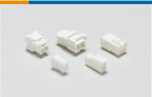
Rectangular Power Connectors(301)