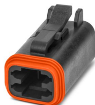
Connector housing, Crimp contacts

https://www.phoenixcontact.com/us/products/1520766