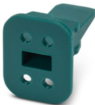
Terminal position assurance, material: PA-GF

Please be informed that the data shown in this PDF document is generated from our online catalog. Please find the complete data in the user documentation. Our general terms of use for downloads are valid.