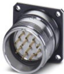
Device connector for rear wall, straight, Screw locking, M23, No. of pos.: 12, type of contact: Pin, Solder-in connection, Flat gasket, 4x M2.5

Please be informed that the data shown in this PDF Document is generated from our Online Catalog. Please find the complete data in the user's documentation. Our General Terms of Use for Downloads are valid ( http://phoenixcontact.com/download )