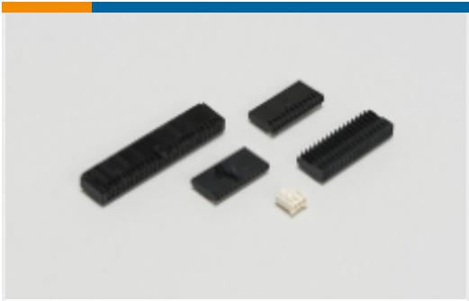
Wire-to-Board Connector Assemblies & Housings(76)