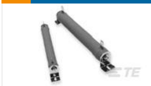
TE Part #2-1879455-9 TE 1500W 220R 5% Bracket