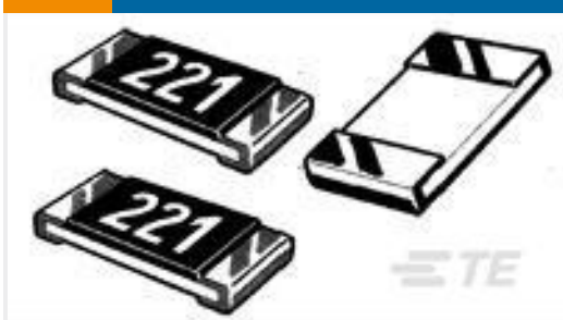
TE Part #4-2176230-4 3522 3K3 5% 3W