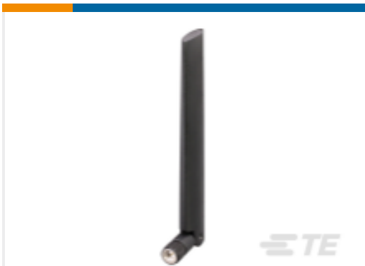
TE Part #ANT-W63WS2-SMA Antenna Blade Wifi6/6E Swivel SMA