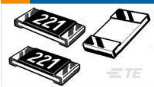
TE Part #2176230-5 3522 1R8 5% 3W