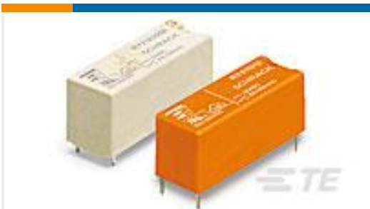
TE Part #1-1393225-9 RY611012