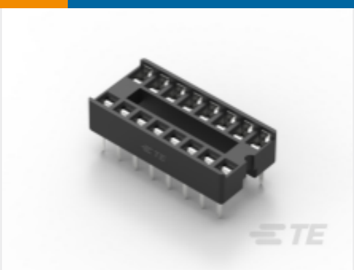
TE Part #1-2199298-6 DIP Socket: Low Profile, Stamped & Formed, Open, Tin