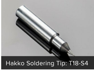
Hakko Soldering Tip: T18-S4