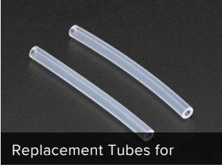
Replacement Tubes for