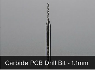
Carbide PCB Drill Bit - 1.1mm