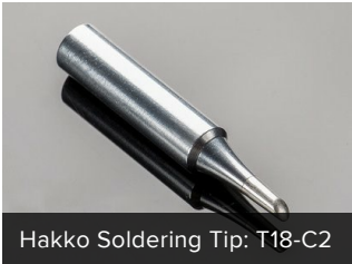
Hakko Soldering Tip: T18-C2