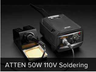
ATTEN 50W 110V Soldering