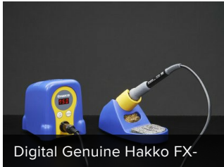
Digital Genuine Hakko FX-