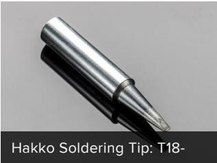
Hakko Soldering Tip: T18-