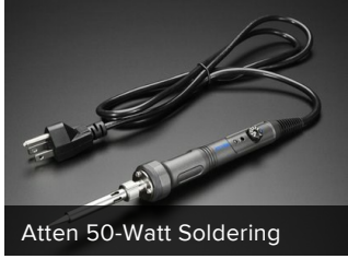
Atten 50-Watt Soldering