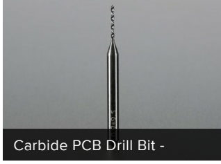
Carbide PCB Drill Bit -