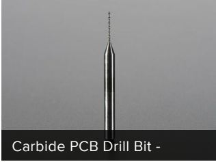
Carbide PCB Drill Bit -