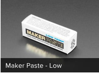
Maker Paste - Low