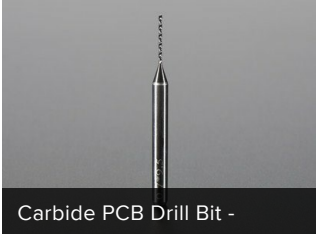
Carbide PCB Drill Bit -