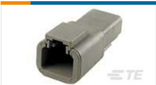
TE Part #DTP04-2P REC, 2P, GRY, N