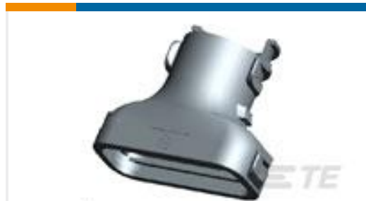
TE Part #1670866-1 COVER,180