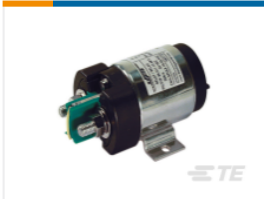
TE Part # CAT-AL6-KSPR30200 Power Relay, 200A, Standard, Bistable, 2 Coils, Polarized