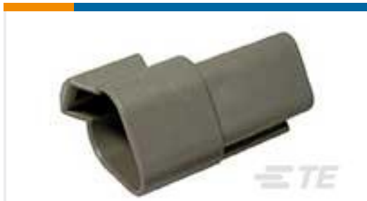
TE Part #DT04-3P REC, 3P, GRY, N