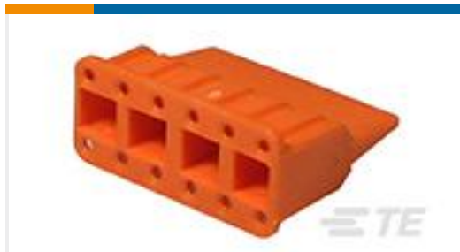
TE Part #WM-12S WEDGE LOCK, 12P, PLG, ORG, DTM