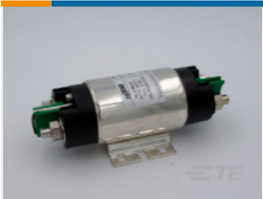
TE Part # CAT-AL6-KSPR29200 Power Relay, 200A, Standard, Monostable, DC

limits as defined in the Annexes of Directive 2011/65/EU (RoHS2). Finished electrical and electronic equipment products will be CE marked as required by Directive 2011/65/EU. Components may not be CE marked. Additionally, the part numbers that TE has identified as EU ELV compliant have a maximum concentration of 0.1% by weight in homogenous materials for lead, hexavalent chromium, and mercury, and 0.01% for cadmium, or qualify for an exemption to these limits as defined in the Annexes of Directive 2000/53/EC (ELV). Regarding the REACH Regulation, the information TE provides on SVHC in articles for this part number is based on the latest European Chemicals Agency (ECHA) 'Guidance on requirements for substances in articles' posted at this URL: https://echa.europa.eu/guidance-documents/guidance-on-reach