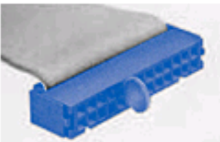
Plastic Key for Socket Connector