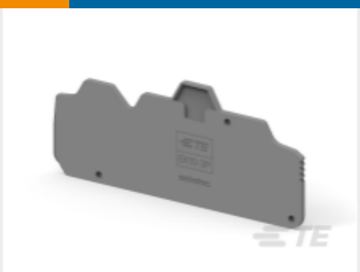
TE Part #1SNK710911R0000 EK10-3P