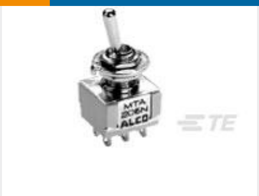
TE Part #2-1437558-0 MTA206N=(MSTA) SW TOG DPDT