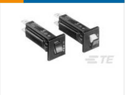
TE Part #3-1393250-4 W28-XQ1A-3=W28-