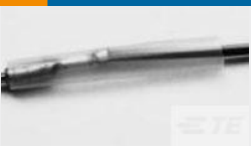
TE Part #CV25342001 RW-175-E-1/4-X-STK