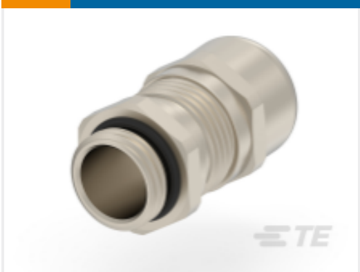
TE Part #1SNG614002R0000 EM-EMC4-M16-MET-A