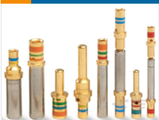
TE Part #100504L CONT SOC ASSY