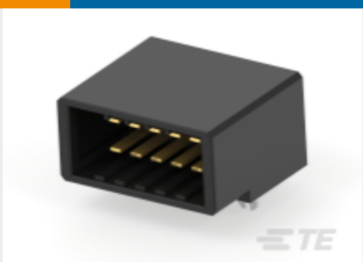
TE Part #178308-2 Header Assembly: Wire-to-Board, 15A, gold or tin plated