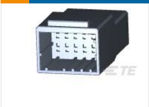
TE Part #1-1318115-6 DYNAMIC D-2100 TAB HSG 12P F/H