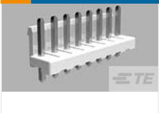
TE Part #1-1123723-4 3.96 EP HDR ASSY 4P(NATURAL)