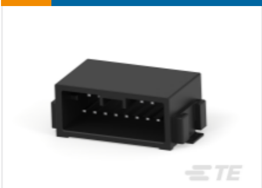
TE Part #1-2834465-6 PCB Mount Header: Wire-to-Board