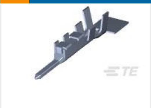
TE Part #1903114-2 DYNAMIC D1000 TAB CONT AU 0.38 um 2L REEL