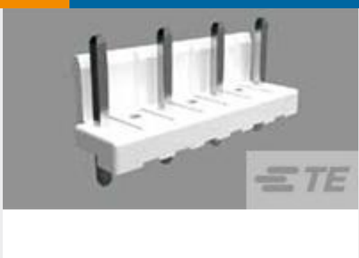
TE Part #1-1123724-3 3.96EP HDR ASSY 3(5)P NATURAL