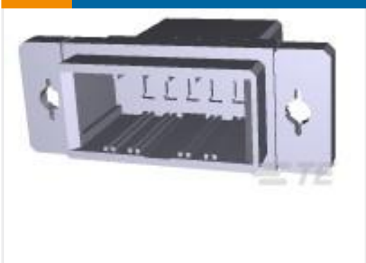
TE Part #178803-5 DYNAMIC D3100D TAB HSG PM 10P