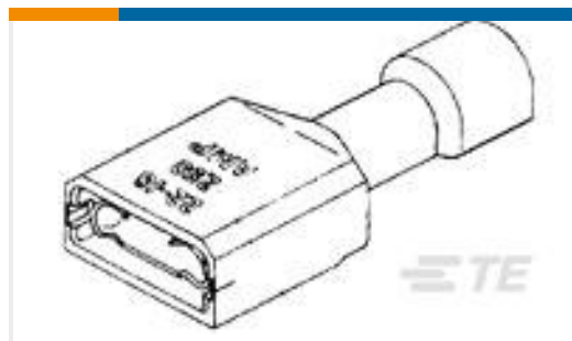
TE Part #2-520273-2 ULTRAFast 110 ASSY REC 22-18 TPBR LP