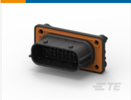
TE Part #SRK15-MDB-32A-001 DEUTSCH Strike Headers