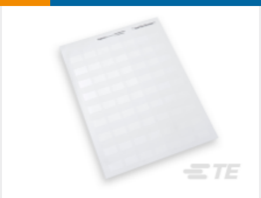
TE Part #8-1768016-8 CSL-05525P-4