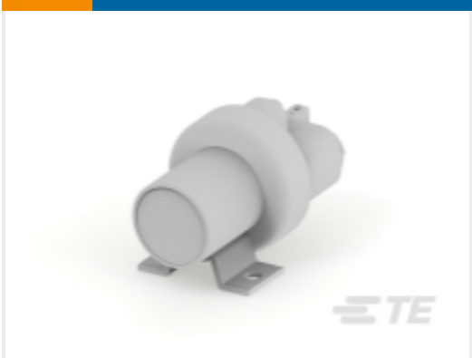
TE Part #K1014846 Relay 26-57-01