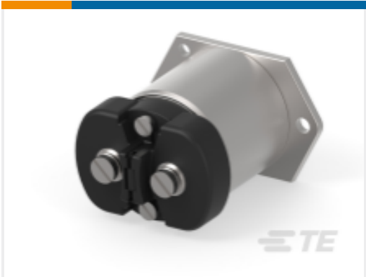
TE Part # K1060281 Relay 29-013-02