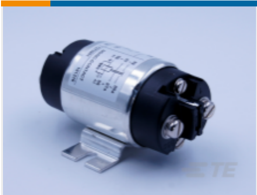
TE Part # CAT-AL6-KSPR2975 Power Relay, 75A, Standard, Monostable, DC

limits as defined in the Annexes of Directive 2011/65/EU (RoHS2). Finished electrical and electronic equipment products will be CE marked as required by Directive 2011/65/EU. Components may not be CE marked. Additionally, the part numbers that TE has identified as EU ELV compliant have a maximum concentration of 0.1% by weight in homogenous materials for lead, hexavalent chromium, and mercury, and 0.01% for cadmium, or qualify for an exemption to these limits as defined in the Annexes of Directive 2000/53/EC (ELV). Regarding the REACH Regulation, the information TE provides on SVHC in articles for this part number is based on the latest European Chemicals Agency (ECHA) 'Guidance on requirements for substances in articles' posted at this URL: https://echa.europa.eu/guidance-documents/guidance-on-reach