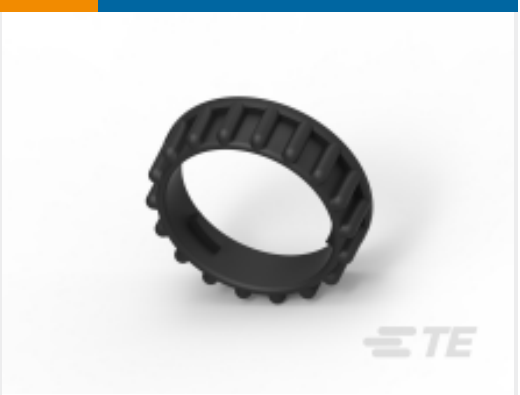
TE Part #965687-1 FIXING RING