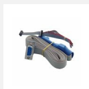
Serial Programming Cable with 1.27 mm Connectors