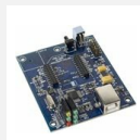
Interface Board - XBee, USB

Contact a Digi expert and get started today! CONTACT US ►