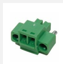
Power Screw Terminal