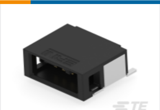
TE Part #504255-E MCBA 4 M * SMD 137 * 176 * GURT * J 2 50