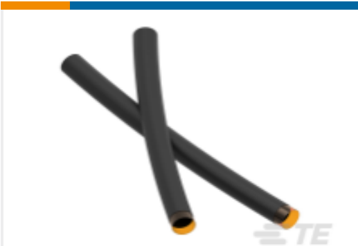
TE Part #NB13982001 TAT-125-1/8-0-STK