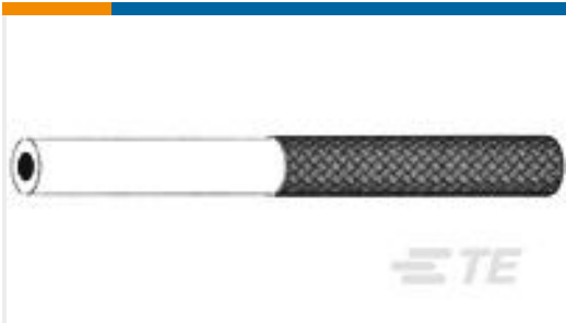
TE Part #D561523001 RAY-101-4.0(100)