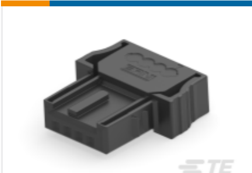
TE Part #524421-E MCBP 4 F 2 035 137 * 197 1,27 TRAY VR2 J

MCBP 4 M * SMD 137 * 197 * GU-H C2 J 2 5