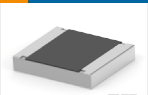
TE Part #2176346-6 CRGCQ 1210 6R8 5%