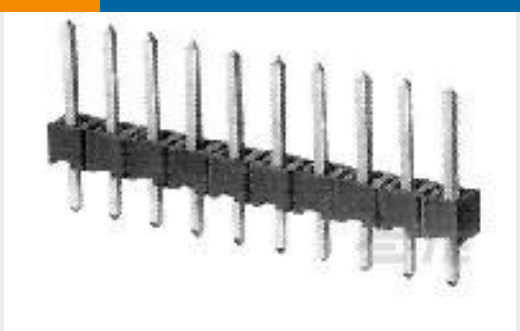
TE Part #1-826629-6 16X1 AMPMODU II HDR ST