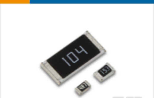
TE Part #2176345-5 CRGCQ 1210 22R 1%