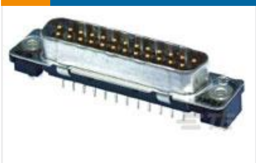
TE Part #5-338311-2 25POS.HD20 PLUG ASS