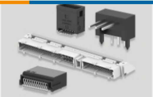
PCB Headers & Receptacles(1629)