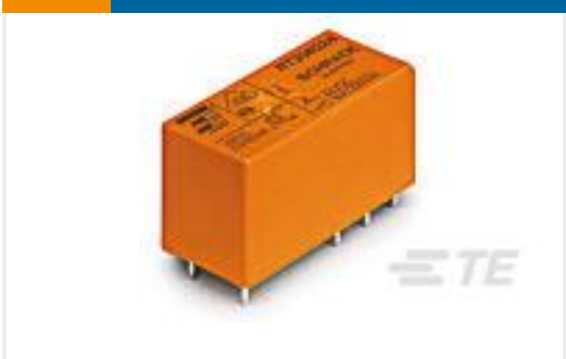
TE Part #9-1393243-9 RT444024