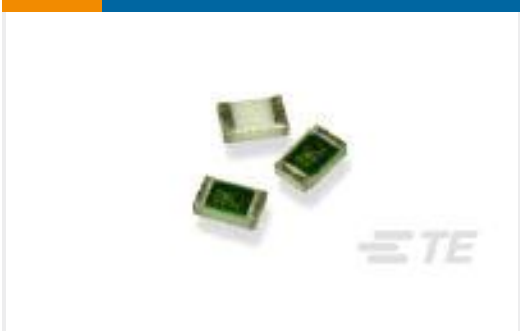
TE Part #1879337-6 CPF 0603 2K8 1% 50PPM 1K RL