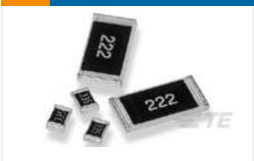
TE Part #9-1879509-4 CRGH0805 1% 1K0 0.33W