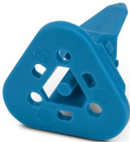
Terminal position assurance, number of positions: 3, material: PA-GF

Please be informed that the data shown in this PDF document is generated from our online catalog. Please find the complete data in the user documentation. Our general terms of use for downloads are valid.