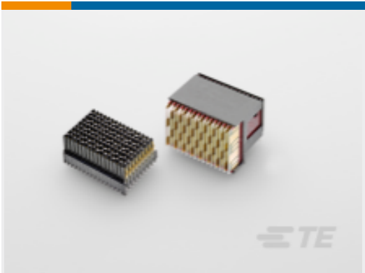
TE Part #2302791-1 VERTRECASSY,CENTER,RTM, MULTIGIG RT3