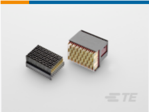
TE Part #2313238-1 VERTRECASSY,J0/J1A,MULTIGIG RT3