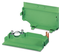
Cable housing, product range: KGS-MSTB 2,5

Please be informed that the data shown in this PDF document is generated from our online catalog. Please find the complete data in the user documentation. Our general terms of use for downloads are valid.