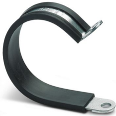
Hose clamp, material: Steel, galvanized, color: black/silver

https://www.phoenixcontact.com/us/products/3240973