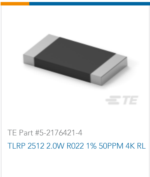
TE Part #5-2176421-4 TLRP 2512 2.0W R022 1% 50PPM 4K RL