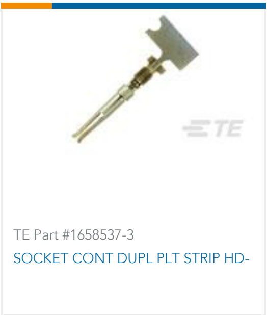
TE Part #1658537-3 SOCKET CONT DUPL PLT STRIP HD-