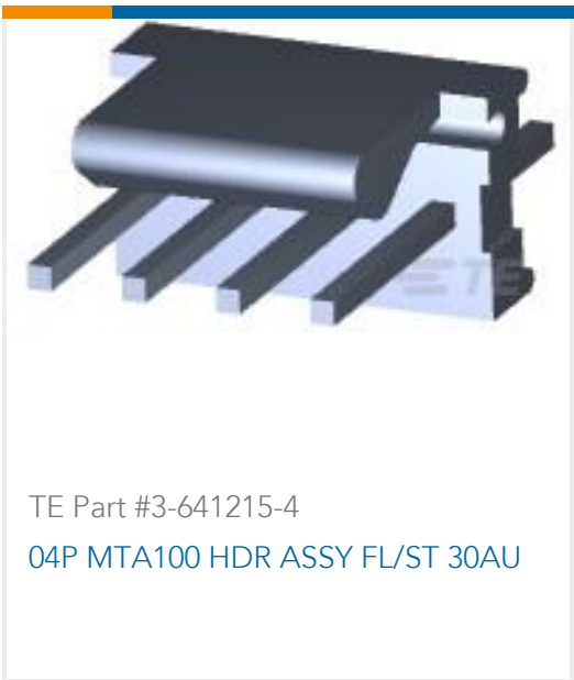
TE Part #3-641215-4 04P MTA100 HDR ASSY FL/ST 30AU