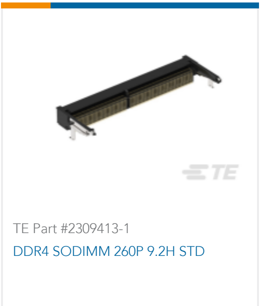
TE Part #2309413-1 DDR4 SODIMM 260P 9.2H STD