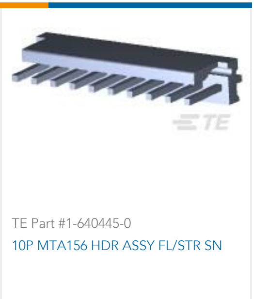
TE Part #1-640445-0 10P MTA156 HDR ASSY FL/STR SN