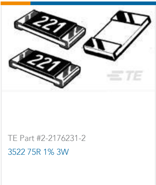
TE Part #2-2176231-2 3522 75R 1% 3W