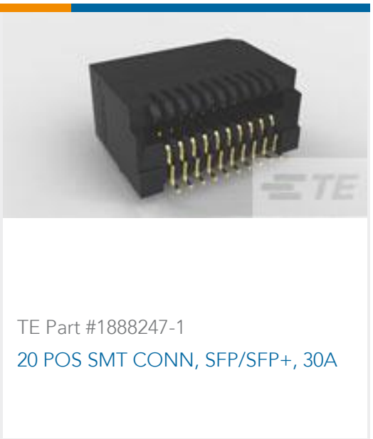
TE Part #1888247-1 20 POS SMT CONN, SFP/SFP+, 30A