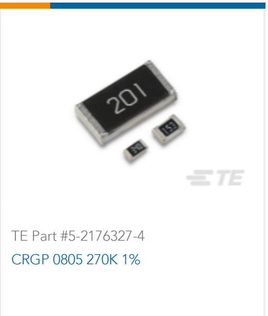
TE Part #5-2176327-4 CRGP 0805 270K 1%