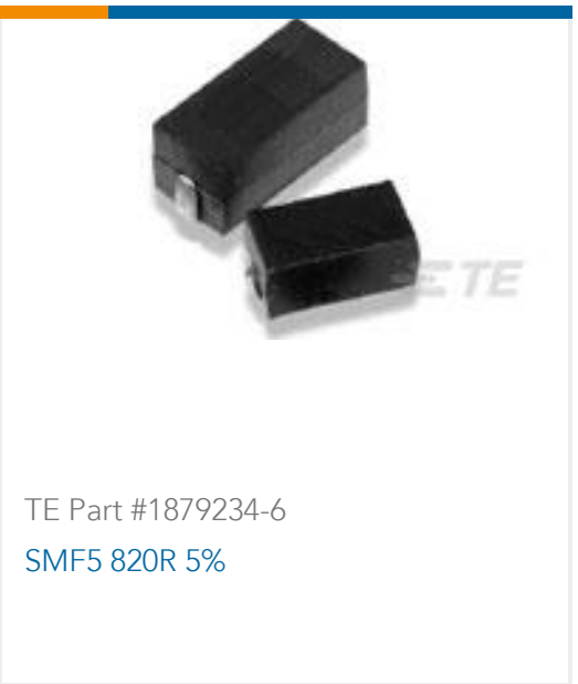
TE Part #1879234-6 SMF5 820R 5%