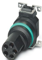
Contact carrier, Universal, 5-position, Socket, straight, M8, coding: B, PCB mounting, SMD reflow, Alternative product in accordance with RoHS II without Exemption 6c (Pb < 0.1 %) item no.: 1308288

Please be informed that the data shown in this PDF document is generated from our online catalog. Please find the complete data in the user documentation. Our general terms of use for downloads are valid.