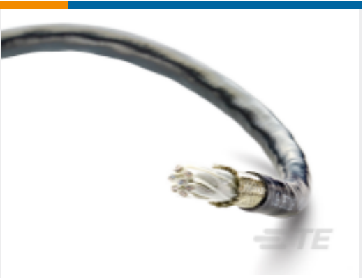
TE Part #C580003001 VG-95218-T028-C019CK3100