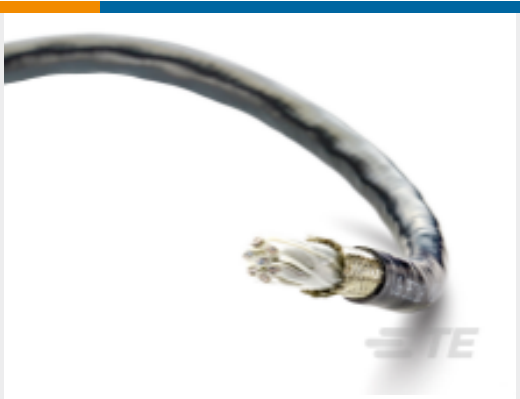
TE Part #C249883001 VG-95218-T028-C007CK3100