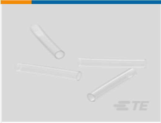
TE Part #NB15964001 RT-375 Heat Shrink Tubing