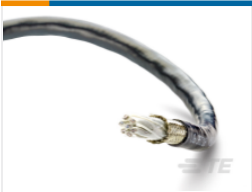
TE Part #CQ73903001 VG-95218-T028-C123CK3100