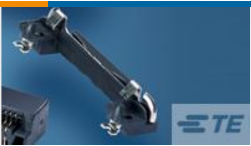
TE Part #1717832-2 MINI PCI EXPRESS EMBOSS TAPE LATCH