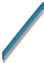
Plug-in bridge, pitch: 3.5 mm, number of positions: 50, color: blue

Please be informed that the data shown in this PDF document is generated from our online catalog. Please find the complete data in the user documentation. Our general terms of use for downloads are valid.