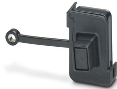
Sealing plugs with locking, for Power push-pull panel mounting frames (VS-PPC-F2...), IP65/67 protection, 500 pieces

Please be informed that the data shown in this PDF document is generated from our online catalog. Please find the complete data in the user documentation. Our general terms of use for downloads are valid.