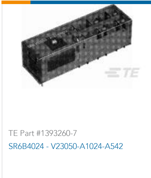
TE Part #1393260-7 SR6B4024 - V23050-A1024-A542