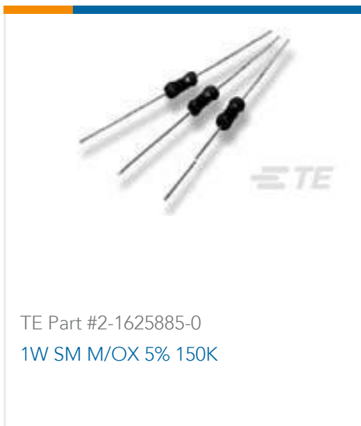
TE Part #2-1625885-0 1W SM M/OX 5% 150K