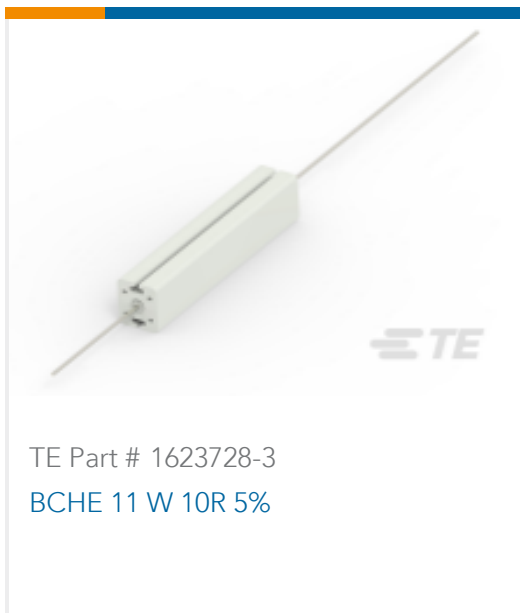
TE Part # 1623728-3 BCHE 11 W 10R 5%