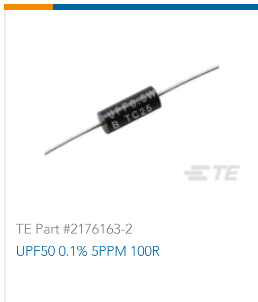
TE Part #2176163-2 UPF50 0.1% 5PPM 100R