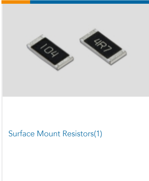
Surface Mount Resistors(1)