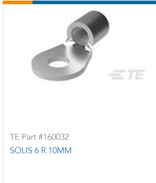
TE Part #160032 SOLIS 6 R 10MM