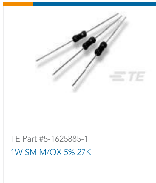
TE Part #5-1625885-1 1W SM M/OX 5% 27K