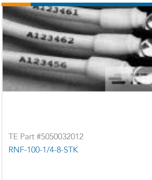
TE Part #5050032012 RNF-100-1/4-8-STK