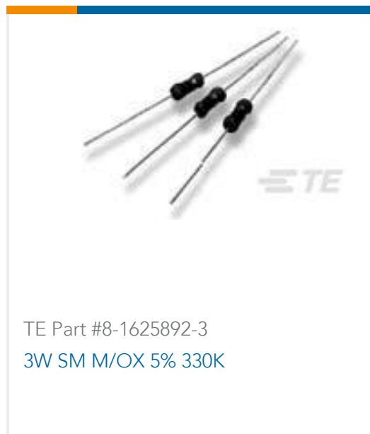
TE Part #8-1625892-3 3W SM M/OX 5% 330K