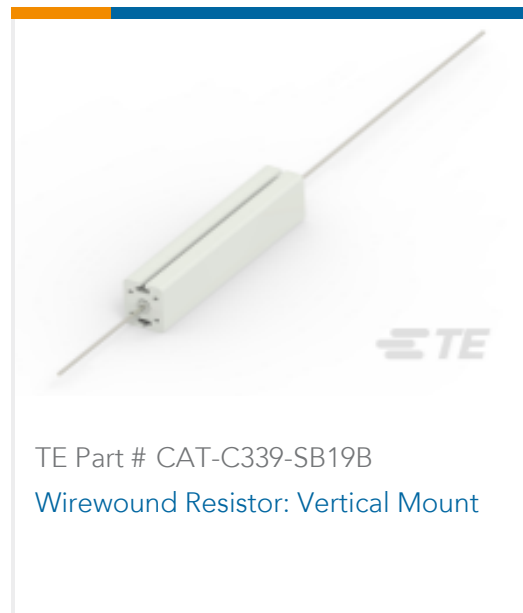
TE Part # CAT-C339-SB19B Wirewound Resistor: Vertical Mount