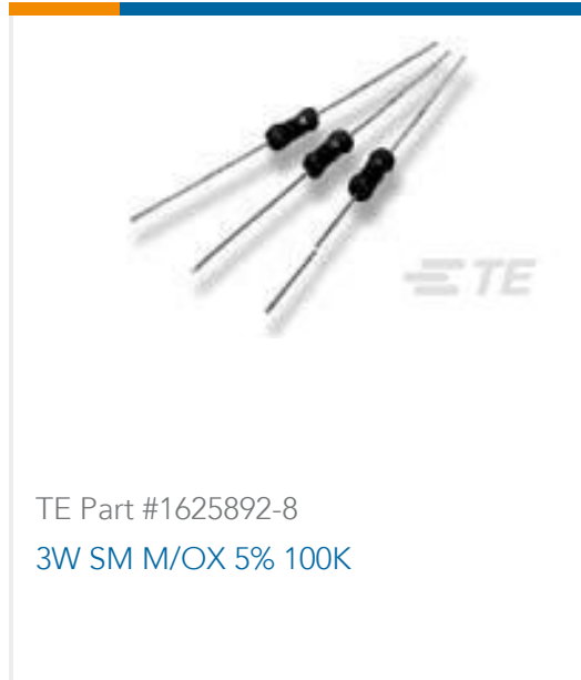
TE Part #1625892-8 3W SM M/OX 5% 100K