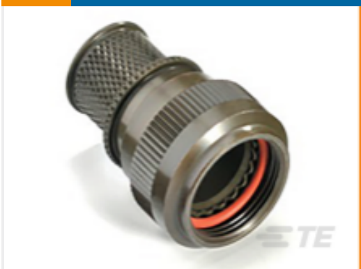
TE Part #BTH1-21-10-1-B-SB BTH1-21-10-1-B-SB