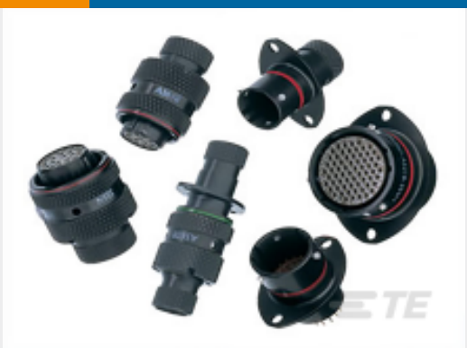
TE Part #AS212-35PA RECEPT.BOX MNTG.TYPE 2