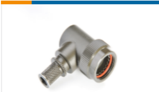
TE Part #AAA7821-00 91A3-14-06-1-B-HE100