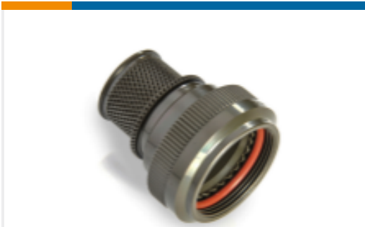
TE Part #EK6083-000 91H1-09-05-1-B-HE100