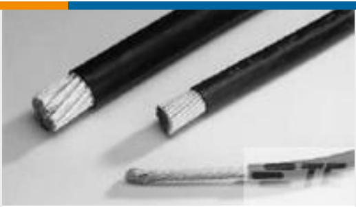
TE Part #2703293001 TR16-70-0