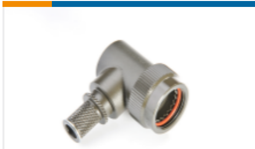
TE Part #EK4869-000 91H3-21-14-1-B-HE300