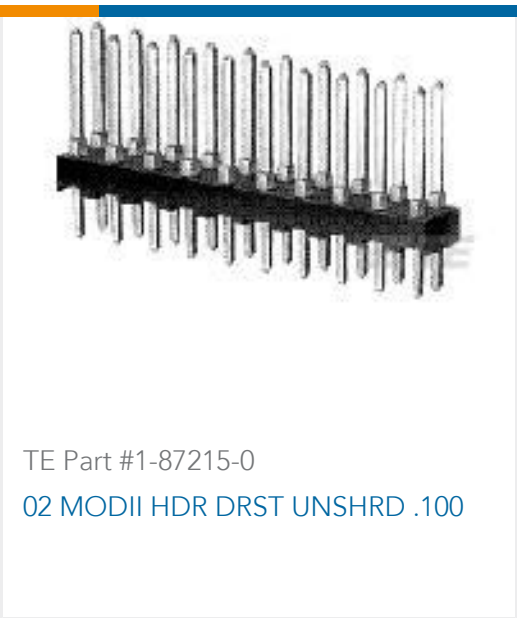
TE Part #1-87215-0 02 MODII HDR DRST UNSHRD .100