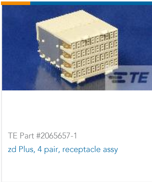
TE Part #2065657-1 zd Plus, 4 pair, receptacle assy