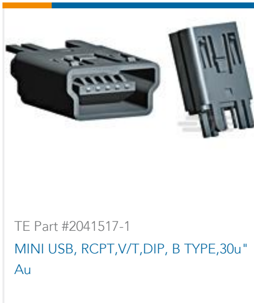
TE Part #2041517-1 MINI USB, RCPT,V/T,DIP, B TYPE,30u" Au