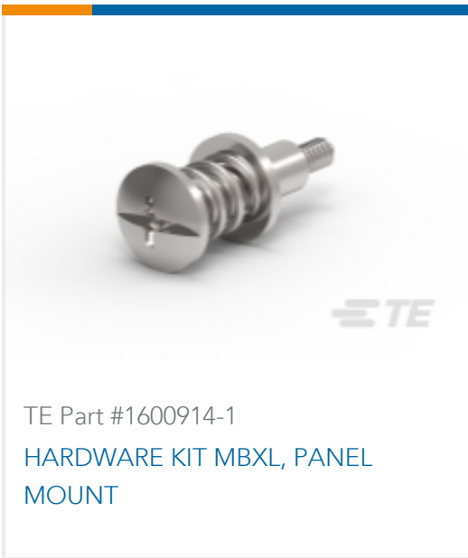
TE Part #1600914-1 HARDWARE KIT MBXL, PANEL MOUNT