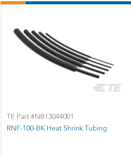
TE Part #NB13044001 RNF-100-BK Heat Shrink Tubing