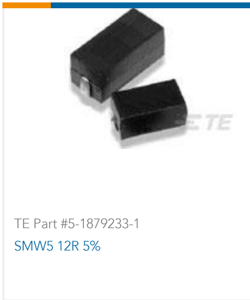
TE Part #5-1879233-1 SMW5 12R 5%