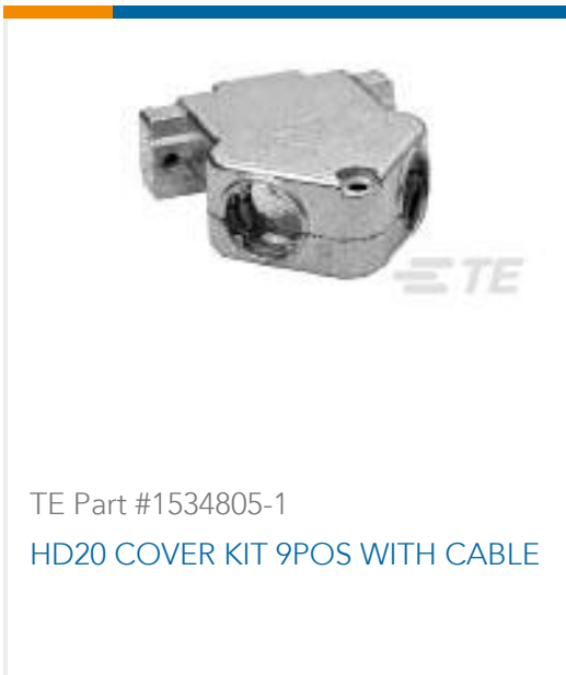
TE Part #1534805-1 HD20 COVER KIT 9POS WITH CABLE