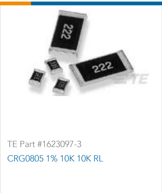
TE Part #1623097-3 CRG0805 1% 10K 10K RL