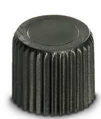
M12 sealing cap for unoccupied M12 plugs of the sensor/actuator cable, flush-type plugs and I/O devices in the field

Please be informed that the data shown in this PDF document is generated from our online catalog. Please find the complete data in the user documentation. Our general terms of use for downloads are valid.