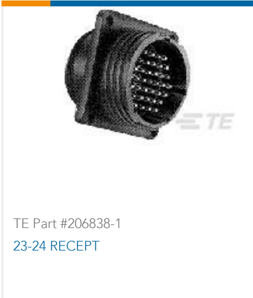
TE Part #206838-1 23-24 RECEPT