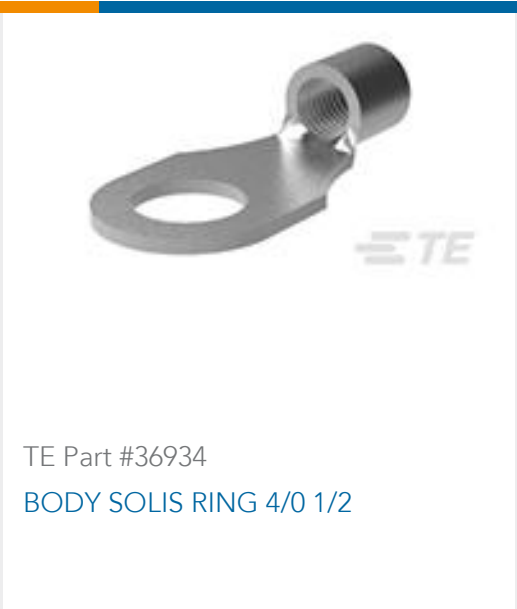
TE Part #36934 BODY SOLIS RING 4/0 1/2