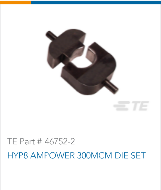
TE Part # 46752-2 HYP8 AMPOWER 300MCM DIE SET