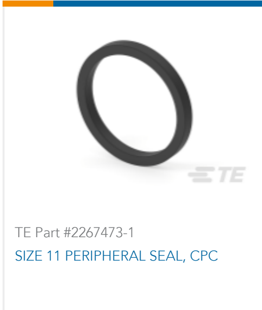
TE Part #2267473-1 SIZE 11 PERIPHERAL SEAL, CPC