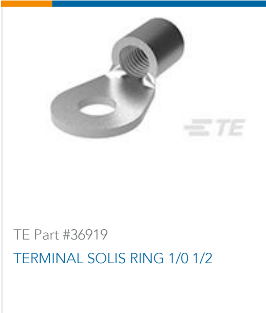
TE Part #36919 TERMINAL SOLIS RING 1/0 1/2