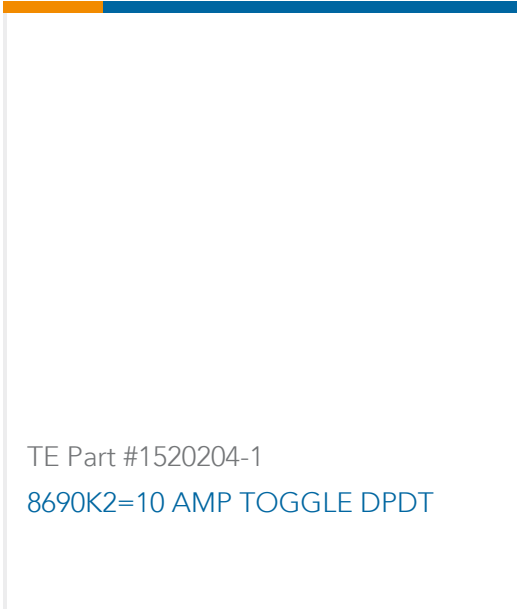
TE Part #1520204-1 8690K2=10 AMP TOGGLE DPDT