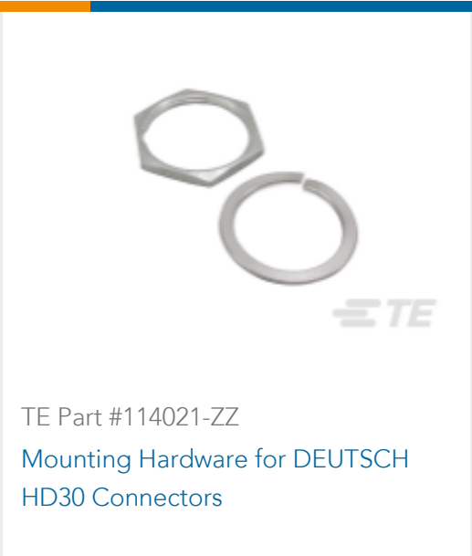
TE Part #114021-ZZ Mounting Hardware for DEUTSCH HD30 Connectors