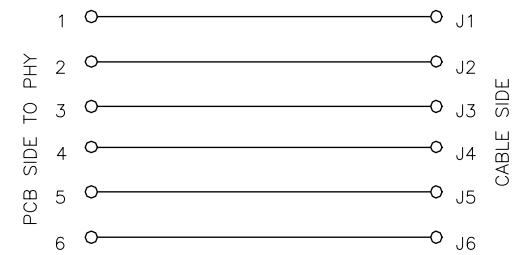
RECOMMENDED PCB LAYOUT VIEWED FROM COMPONENT SIDE

X35AHIWW6SB4009 1:Au=1U" 3:Au=3U" 4:Au=6U" 5:Au=15U" 6:Au=30U"