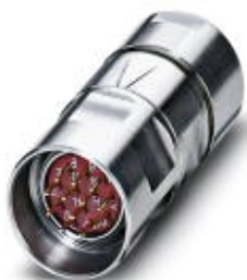
Cable connector, straight, Screw locking, M23, number of positions: 12, type of contact: Pin, Crimp connection, shielded: yes, cable diameter range: 6 mm ... 10 mm

Please be informed that the data shown in this PDF Document is generated from our Online Catalog. Please find the complete data in the user's documentation. Our General Terms of Use for Downloads are valid ( http://phoenixcontact.com/download )