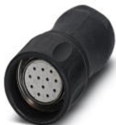
Cable connector, straight plastic-sheathed, shielded: yes, Screw locking, M23, cable diameter range: 5.5 mm ... 6.5 mm

Please be informed that the data shown in this PDF Document is generated from our Online Catalog. Please find the complete data in the user's documentation. Our General Terms of Use for Downloads are valid ( http://phoenixcontact.com/download )