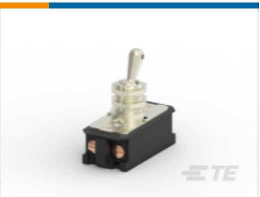
TE Part #1520237-2 7320K3=8 AMP TOGGLE SWITCH