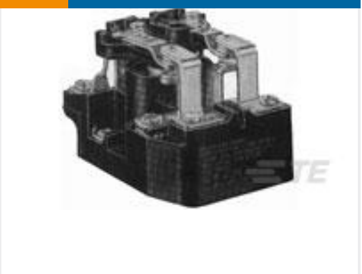
TE Part #1-1393127-2 PRD-11AG0-240=PRD