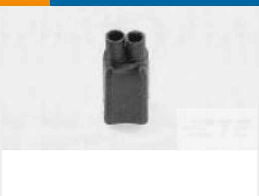
TE Part #037328-001 SSB-1202FR