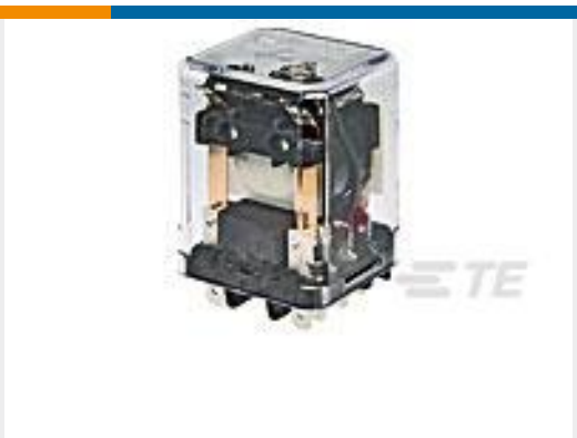
TE Part #4-2027183-3 KUEP-11D15-125=RELAY,3A,2C, AGCDO,QC.187,