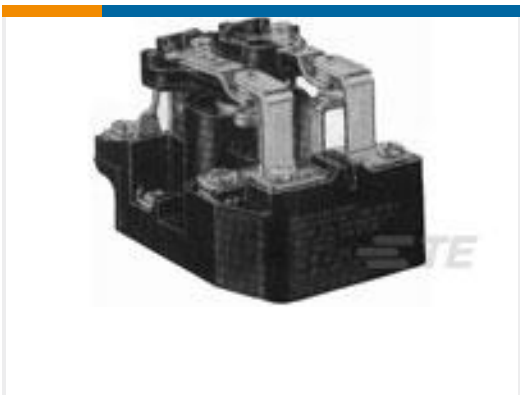
TE Part #1-1393130-6 PRD-7DG0-24=PRD