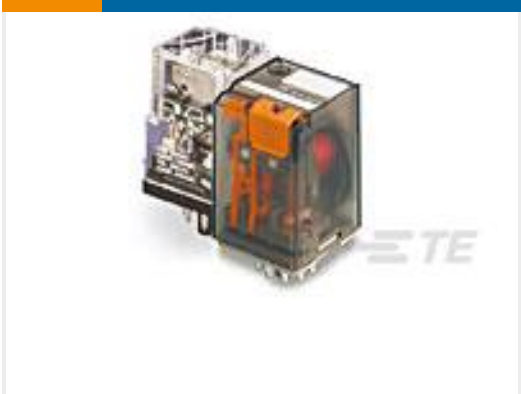
TE Part #4-1393104-6 KRPA-11DG-48=KRPA