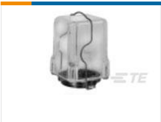
TE Part #3-1393159-3 20C176=SPRING