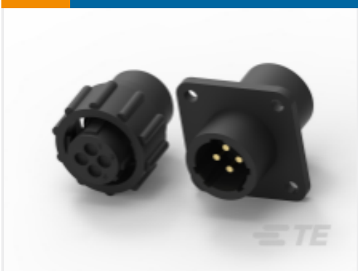
TE Part #211769-1 Cable/Panel Mount Connector, CPC Series 1