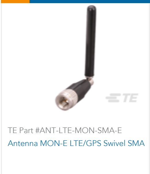
TE Part #ANT-LTE-MON-SMA-E Antenna MON-E LTE/GPS Swivel SMA

Product Drawings GHC 9.0 3POS PLUG HSG BLUE