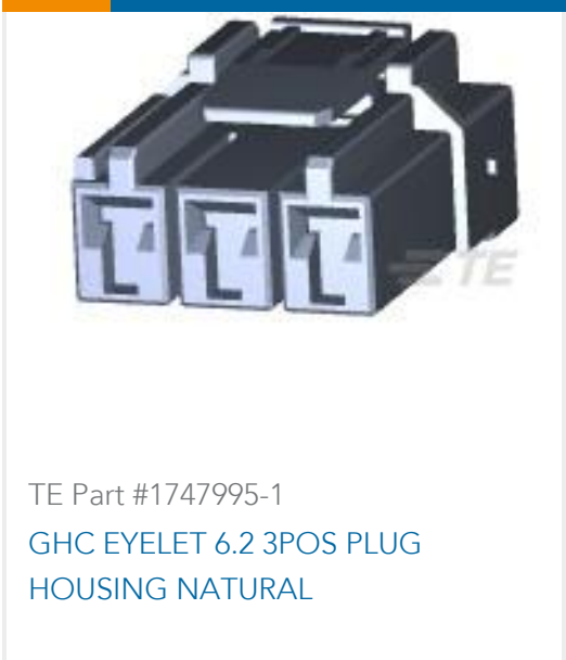
TE Part #1747995-1 GHC EYELET 6.2 3POS PLUG HOUSING NATURAL