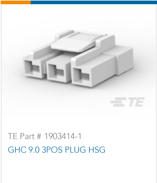
TE Part # 1903414-1 GHC 9.0 3POS PLUG HSG