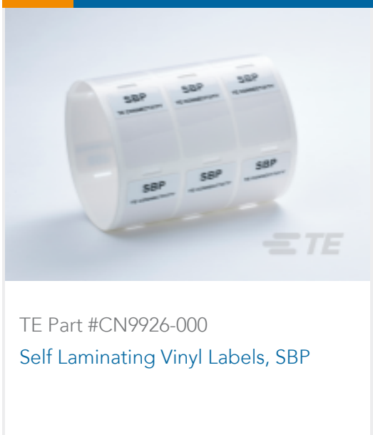
TE Part #CN9926-000 Self Laminating Vinyl Labels, SBP