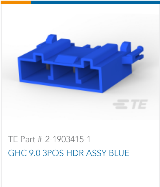
TE Part # 2-1903415-1 GHC 9.0 3POS HDR ASSY BLUE