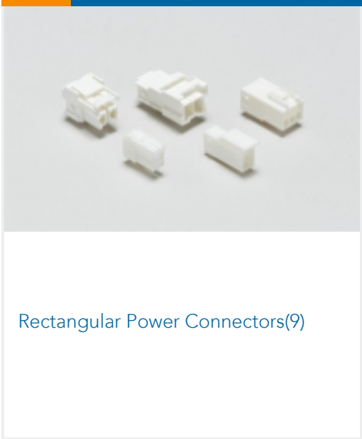
Rectangular Power Connectors(9)