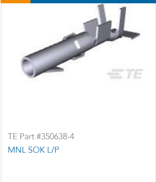
TE Part #350638-4 MNL SOK L/P