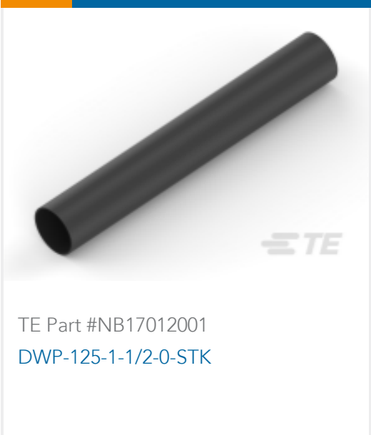
TE Part #NB17012001 DWP-125-1-1/2-0-STK