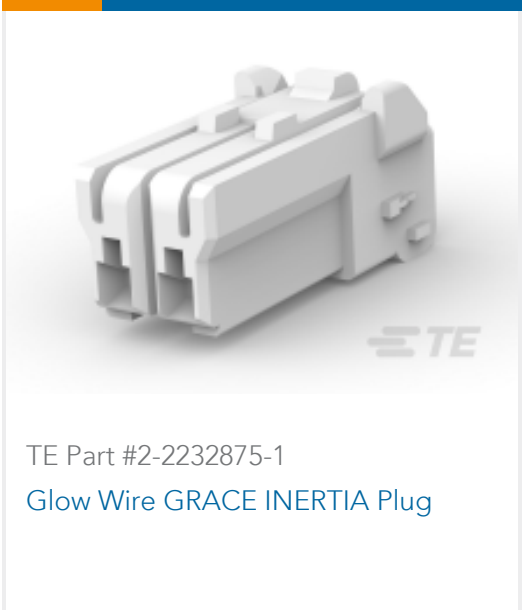
TE Part #2-2232875-1 Glow Wire GRACE INERTIA Plug