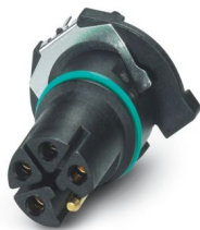
Contact carrier, Power, 5-position, Socket, straight, M12, coding: L, PCB mounting, THR solder connection

Please be informed that the data shown in this PDF document is generated from our online catalog. Please find the complete data in the user documentation. Our general terms of use for downloads are valid.