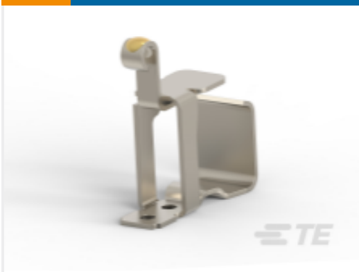
TE Part # 2388202-2 Shield Finger, 3.8mm