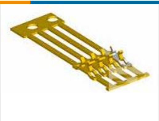
TE Part #1544301-2 CONTACT A SOUDER