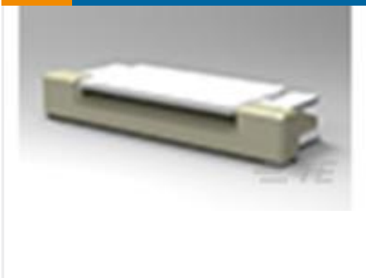
TE Part #1734839-5 FPC CONN. 0.5MM PITCH T/C, 5P