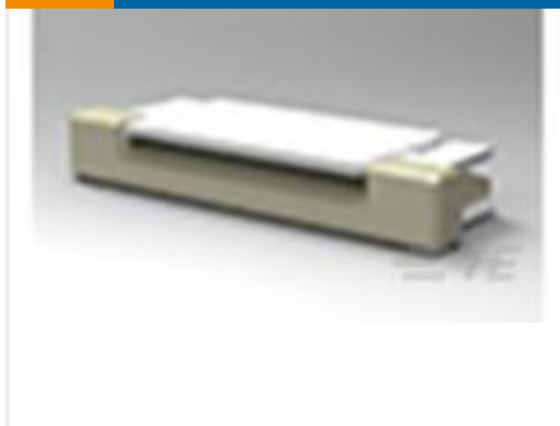
TE Part #1-1734839-6 FPC CONN. 0.5MM PITCH T/C,16P