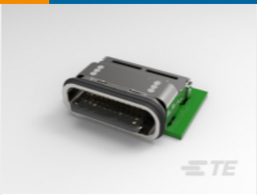
TE Part # 2305018-2 USB TYPE C, REC IPX8 ON BOARD DUAL SMT