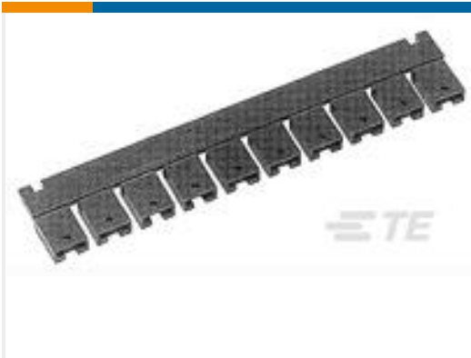
TE Part #382811-5 SHUNT, ECON, PHBRN, BLACK