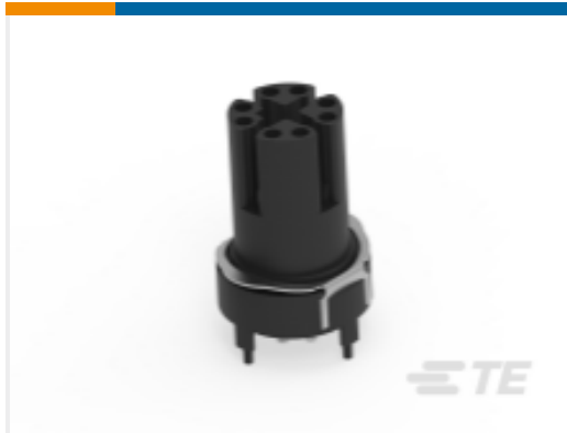
TE Part #394811-E M12 FEMALE, X CODE, 8P, 17MM SMT, CAT6A