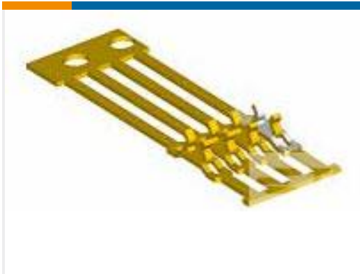
TE Part #1544223-1 CONTACT 718 MODIFI