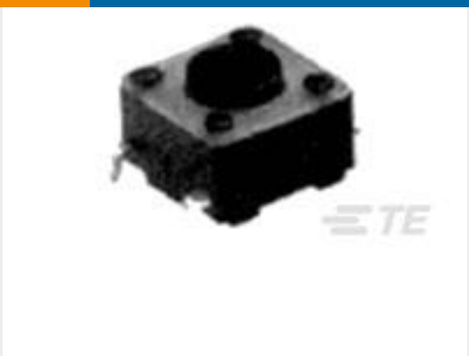
TE Part #1977223-6 FSM2JSMASTR=6MM TACT SWITCH,