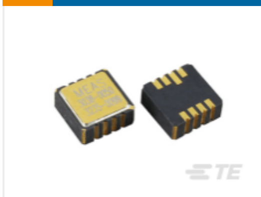
TE Part #3038-0200 Model 3038 SMT DC Accelerometers