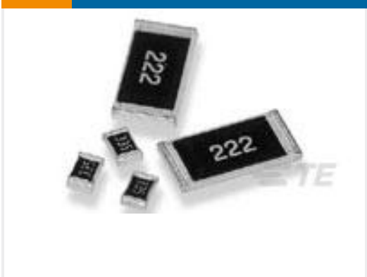
TE Part #1622853-1 CRG0603 1% 15K