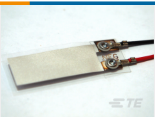
TE Part #11029806-00 Piezoelectric Vibration Sensor, Polymer