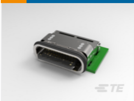
TE Part #2305018-2 USB TYPE C, REC IPX8 ON BOARD DUAL SMT