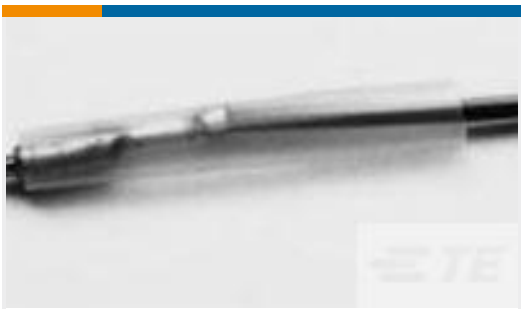
TE Part #CV20922001 RW-175-E-3/64-X-STK