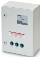
Indoor/outdoor lightning current arrester and TVSS system for 120/208-240 V

Please be informed that the data shown in this PDF document is generated from our online catalog. Please find the complete data in the user documentation. Our general terms of use for downloads are valid.