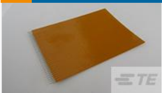
TE Part #2-1474654-9 FSN-21A-15