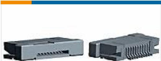
TE Part #2-1734592-4 FPC CONN. 0.5MM PITCH B/C, 24P