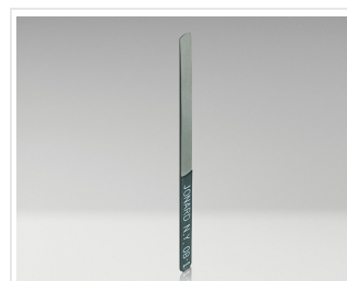
OB-1/12 - Burnisher Files (Pkg. 12), Fine