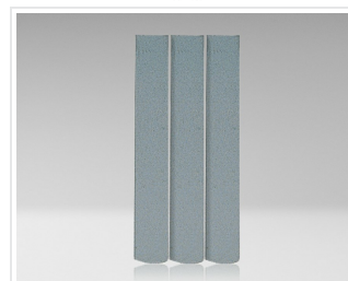
B-7/25 - Replacement Blades .007" Thick (Pkg. /25)